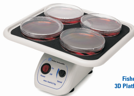
Fisher Scientific 3D Platform Rotator 13-687-705

Use Promo No. 13-687-707PM to receive free dimpled mat with unit