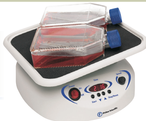
Fisher Scientific Platform Rocker 13-687-704

Use Promo No. 13-687-704PM to receive free dimpled mat with unit