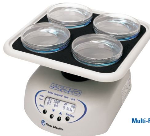
Fisher Scientific Multi-Function 3D Rotator 13-687-707

Use Promo No. 13-687-704PM to receive free dimpled mat with unit