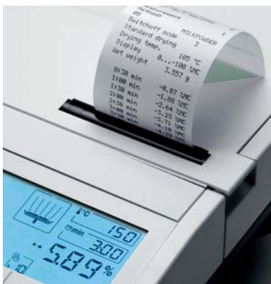
Brilliant display and GLP/GMP compliant protocols

Moisture measurements require just three operator steps: Tare the sample pan, insert the sample and press start. The measurement runs automatically and delivers reliable results within minutes.