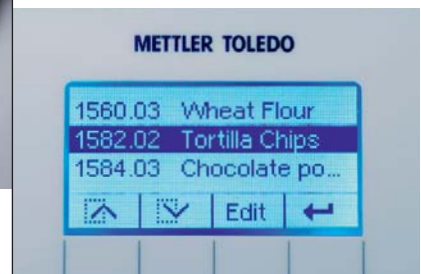
Integrated method library

The integrated method library offers ready-to-use methods for more than 100 substances. Method development becomes simple and fast. All methods are fully tested and compliant to official regulations.