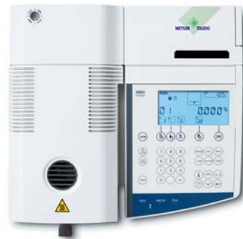
HR83 The high-end solution For highest demands and regulated areas