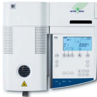
HG63 The precision instrument Perfect for routine tests in the laboratory