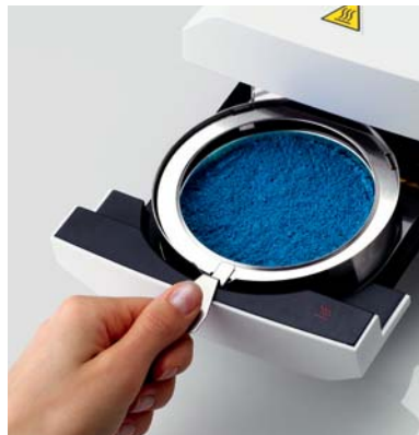
Safe sample handling Automatic drawer Easy operations