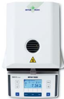
HB43-S The workhorse Ideal for measurements in production environments